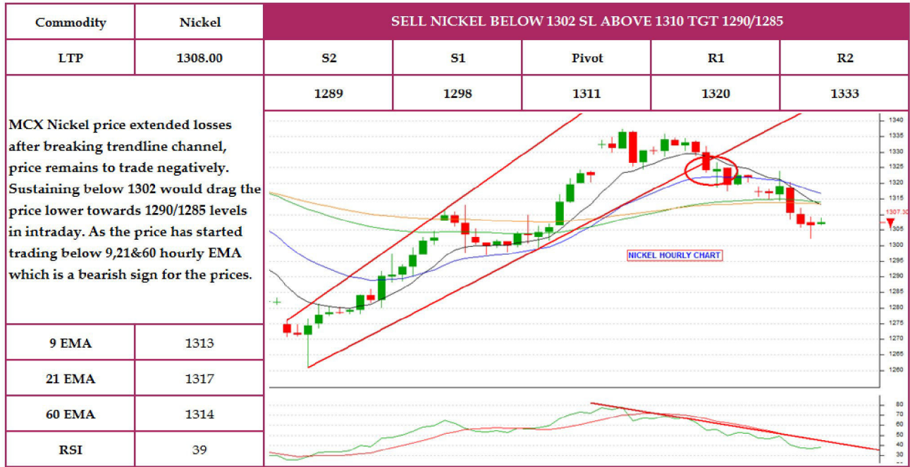
Chart of the days